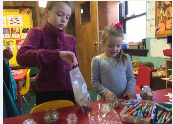
Enrichment— We learned about the gifts of the Magi—gold, frankincense, and myrrh.