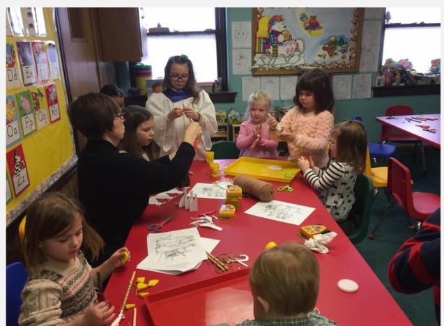
Fishers of Men craft — we are fishers of men!