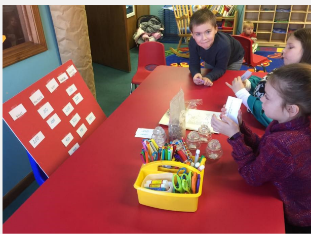
Jeopardy during Enrichment to see how much we have learned.